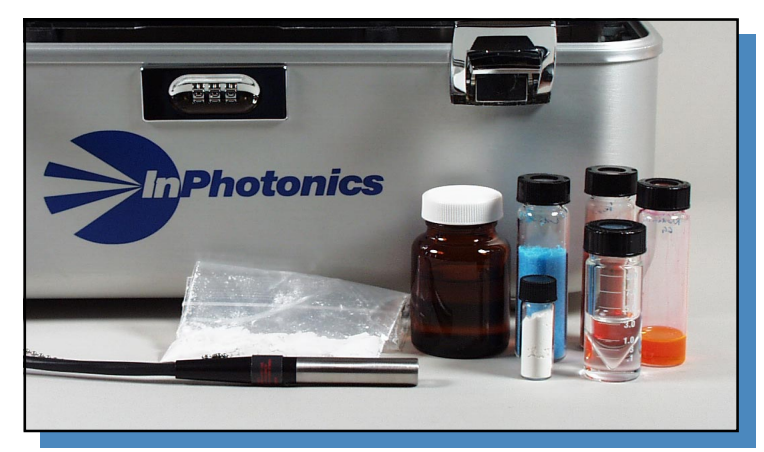
Focussed optics enable the RamanProbe to "see" through glass and plastic.

One of the many advantages of Raman spectroscopy is that measurements can be made without extensive sample preparation. The InPhotote is compatible with InPhotonics' innovative RamanProbe<sup>TM</sup> line of versatile fiber optic sampling probes up to 200 m in length. The standard hand-held probe enables measurement of solids and liquids through packaging materials, avoiding direct contact with potentially harmful substances. Probes can be extended by up to 200 m such that the InPhotote can remain in a "safe" area with only the probe exposed to potential hazardous substances. Immersible probes can be routinely decontaminated when necessary.