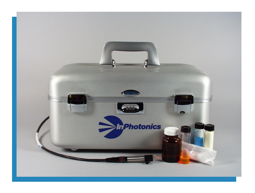
InPhotote™ Portable Raman Spectrometer